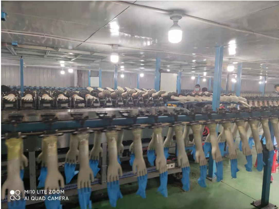
12 Production line